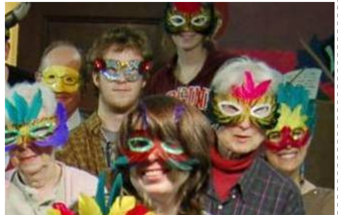
Some of last year's spooktacular participants