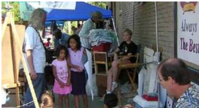
OFD Participants at the Westcott St. Fair 2009