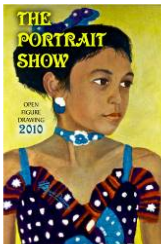
Catalog Covers from previous years