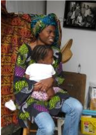
Mother/daughter duo modeling for us.

The models were wrapped in colorful African fabrics by Mardea Warner and sat in front of a hand made batik print, also courtesy of Mardea. The people staffing the Village welcomed us back enthusiastically. This marks the third year where OFD participants demonstrate to fair-goers the process of drawing from a live model.