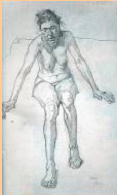
Arms (graphite on paper, 22x15)