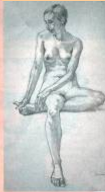
Leisure (graphite on paper, 22x15)