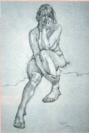
Slope (graphite on paper, 22x15)