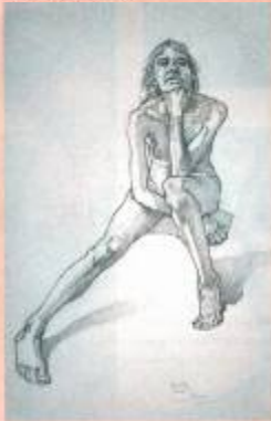
Emly (graphite on paper, 22x15)