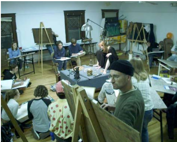
Wednesday evening drawing session.