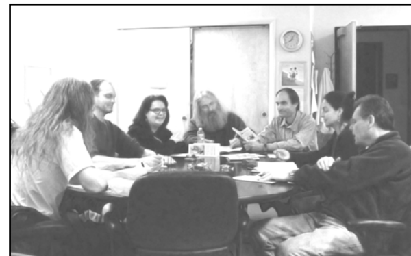
Monthly board meeting.